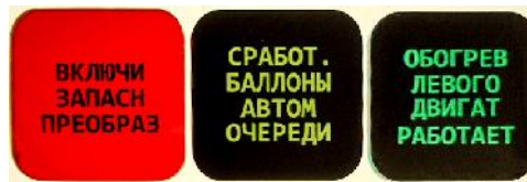
New NVG Compatible Indicator Captions

Consolite has a fully equipped workshop facility where it can also modify individual instruments to NVG compatibility, and then test in its dark room facility to demonstrate compliance with MIL-STD-3009 or other standards if required.